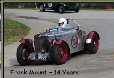
Frank Mount - 14 Years