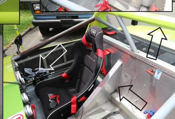
1973 Porsche 914-6 Scott Ryan

When sorting pictures, it looked like we had flipped some images until we realized Ryan's car is RHD. The original builder, an aeronautical engineer, thought this gave an advantage in locating apexes at numerous tracks. The steering, pedal assembly and shifter were all modified to accommodate the RHD change. The builder also went so far as to construct an extra, triangular brace to stiffen the car and fared the roll bar into the Targa bar. Have to admit, the color and graphics are certainly distinctive.