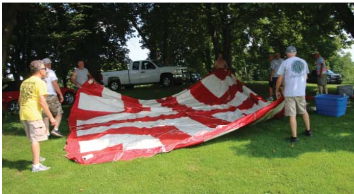
Putting up the tent