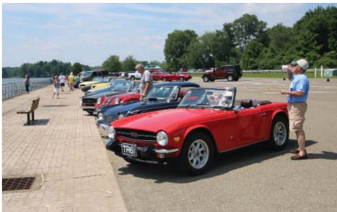
Above; the stop at the Pymatuning "spillway" and below goin' fishin'.