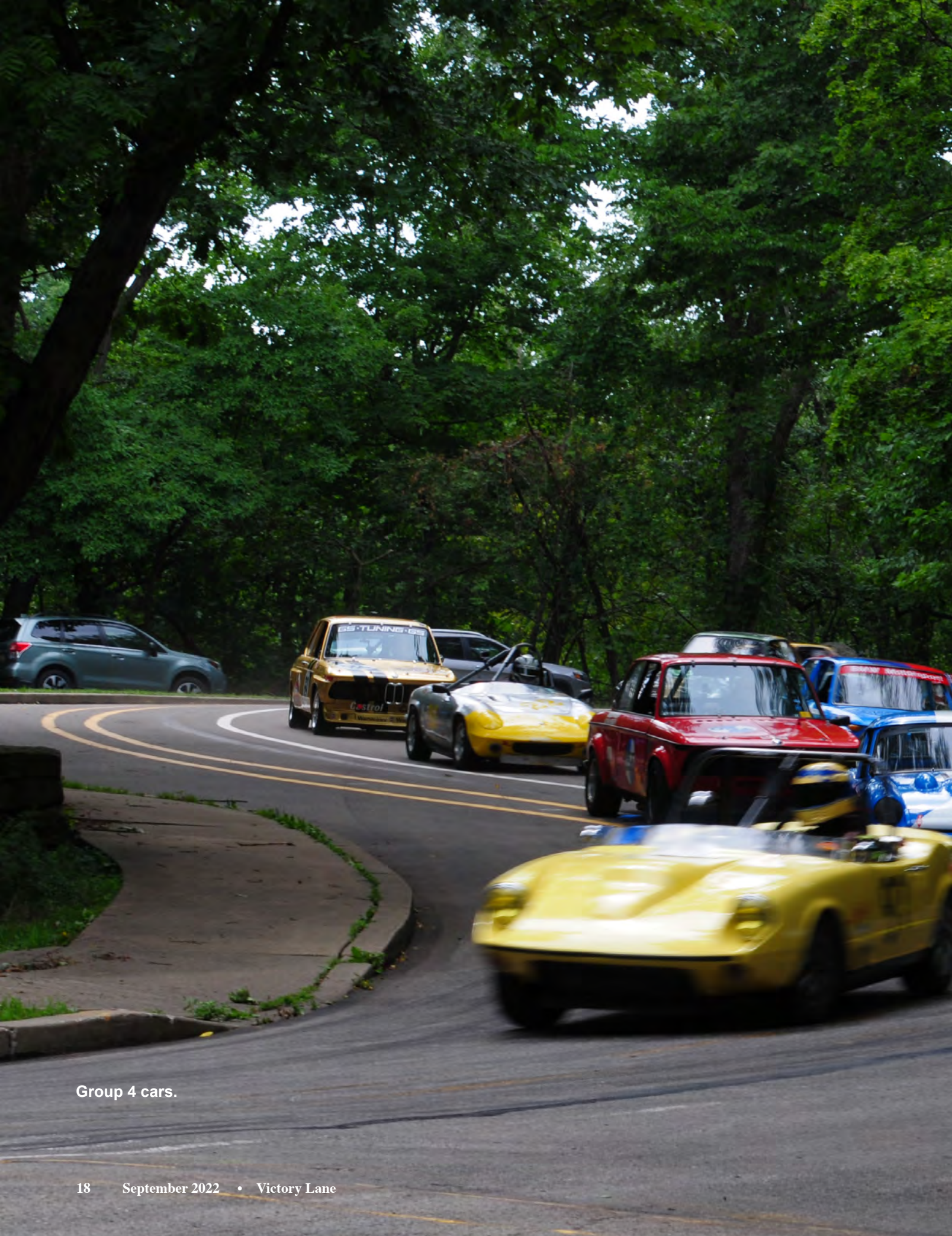
Group 4 cars.